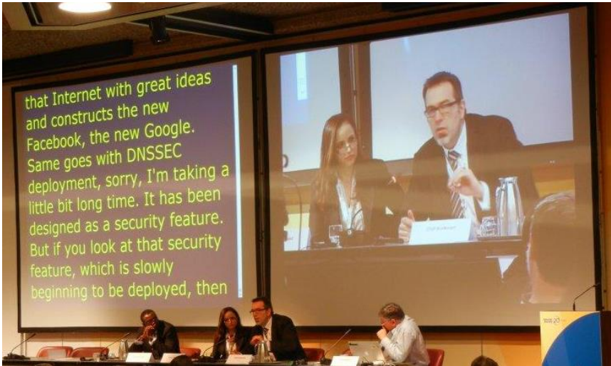
CART (captioning) and video screen of presenters