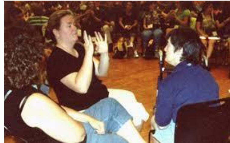
Low Vision and Tactile Interpreting