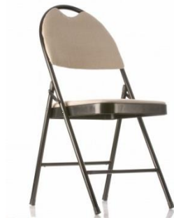
Chairs (vision, health, mobility users get priority)